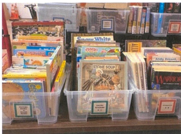
Free Books for All Age Groups at the West Allegheny Food Pantry

A new Little Free Library will soon appear at the North Fayette Community Center located at 580 Donaldson Road. However, you can visit our existing Little Free Libraries located at: Findlay Township Community Center, Main Street, Imperial; Oakdale Parklet, across from the Gazebo; and Walden Woods, to the left on Evergreen Run by the main entrance.