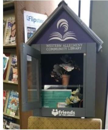
1271 Route 30, Clinton

Little Free Libraries are a way to bring books into the community without having to visit the library. All of these LFLs are regularly stocked and rotated with new material. Anyone may contribute or take books. The more the merrier! If you take a book (or two) from a library, you do not need to return that book. However, residents are encouraged to add a book they may have finished to the LFL for someone else to enjoy.