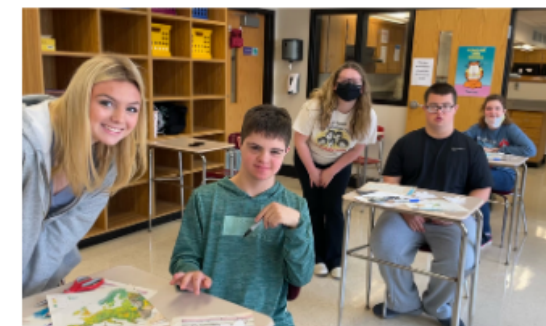
Partners in Education making book page flowers for Links Fairway