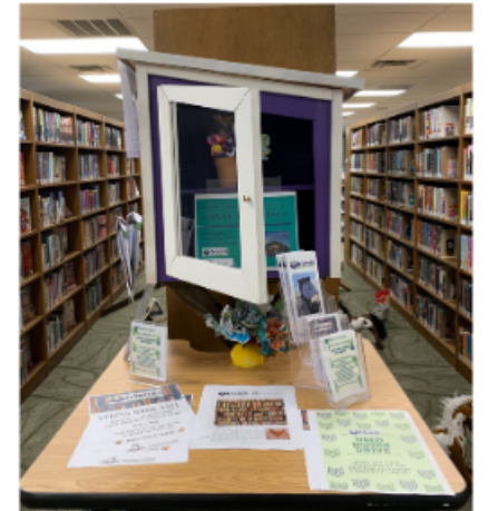
Links for the Library Fairway Sponsorship

WAHS Partners in Education Mission Conforti St. Vincent dePaul (Coraopolis)