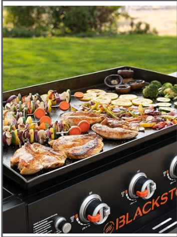
Blackstone 1984 Original 36 inch Front Shelf, Side Shelf & Magnetic Strip Heavy Duty Flat Top Griddle Grill Station for Kitchen, Camping, Outdoor, and Tailgating.

Tickets can be purchased at the Library or via this link: https://bit.ly/FallForYourLibrary